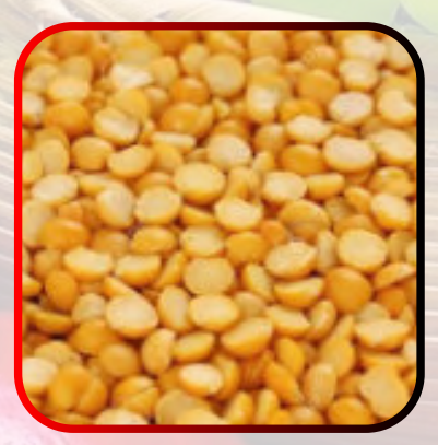
PIGEON PEA/ ARHAR/TUR