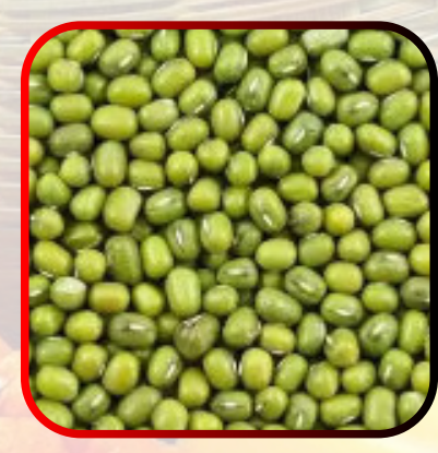
MUNG BEANS / GREEN GRAM