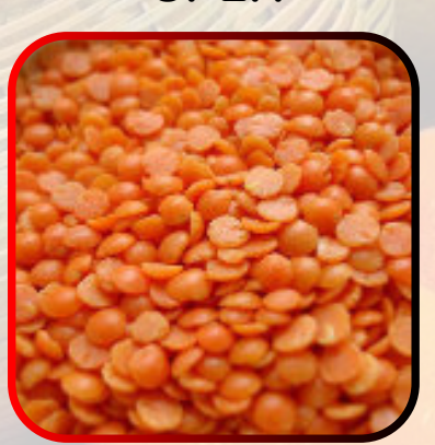
MASOOR DAL/ RED LENTIL