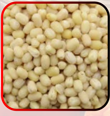
URAD DAL GOTA