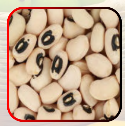
BLACK EYE BEANS/ COWPEA