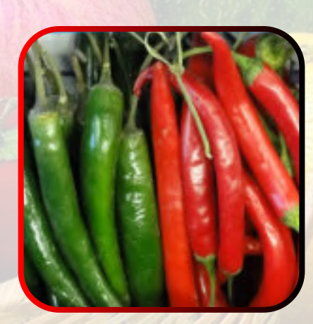
RED & GREEN CHILLY