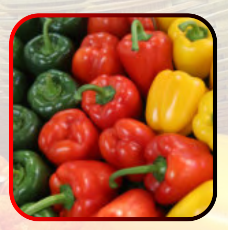
CAPSICUM GREEN/RED/YELLOW PEPPER

We are glad to mention that all our Vegetable Products are 100% Organic & Healthy, Chemical & Pesticides Free, Freshly Picked & Properly Packed for our clients.