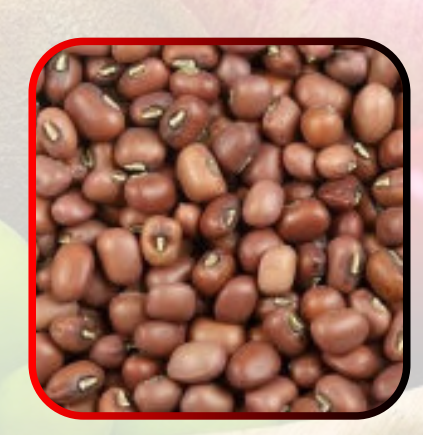
TURKISH GRAM/ MOTH BEANS