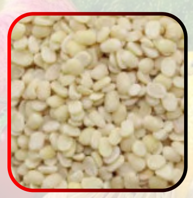
URAD DAL SPLIT