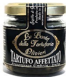
sliced truffle 80g