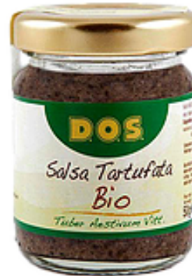
organic black summer truffle sauce 50g/80g