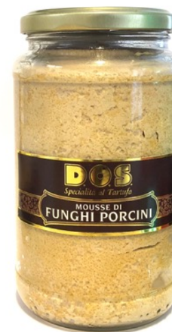
porcini mushroom sauce