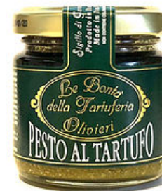
basil pesto with truffle 80g