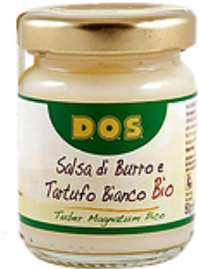
organic butter truffle sauce 50g/80g