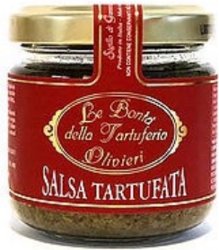
black summer truffle sauce 80g/130g

Le Bontà Line is aimed at everyone. "Balance" is the key-word. Its balanced flavours and its price/quality ratio are the strongest points of this Line. It is available in a wide range of weights and it can be used in many different dishes.