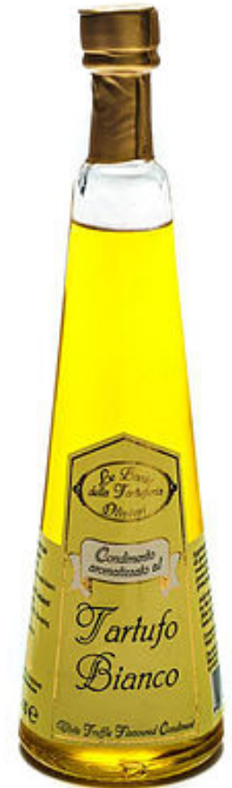
white truffle oil 100ml