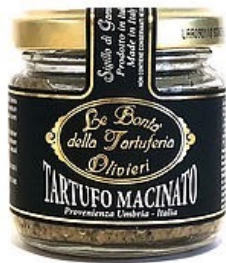
ground truffle 80g/130g