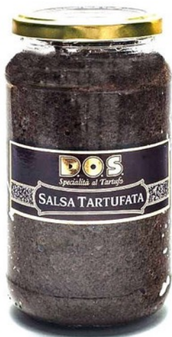
black summer truffle sauce