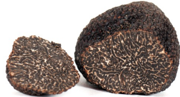
black winter truffle