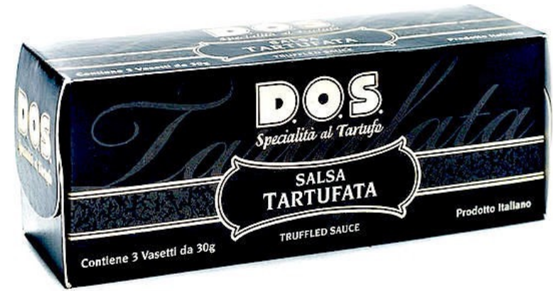
Black Truffle Tris