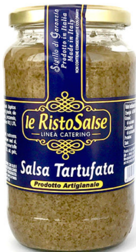
black summer truffle sauce