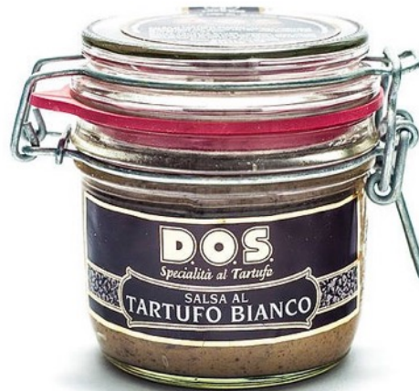
white truffle sauce