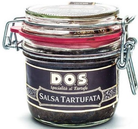
black summer truffle sauce