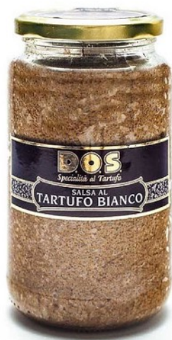
white truffle sauce