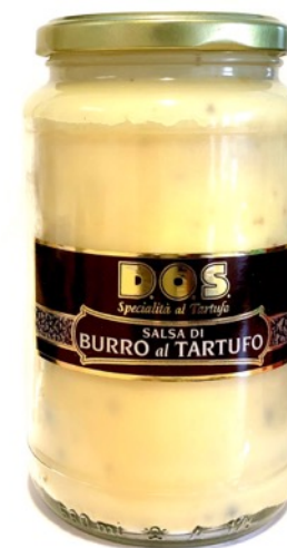
butter truffle sauce