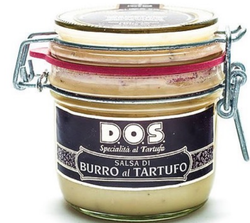
butter truffle sauce