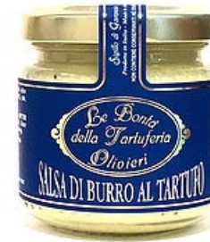
butter truffle sauce 75g