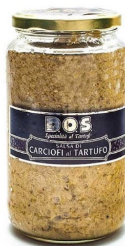
artichokes and truffle sauce