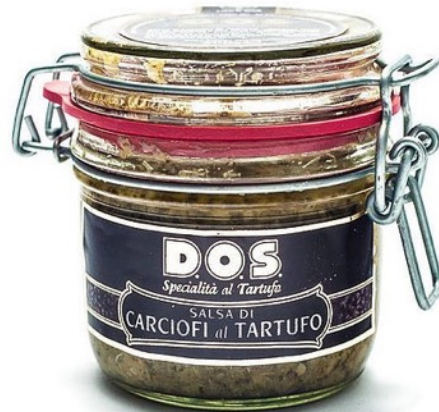
artichokes and truffle sauce