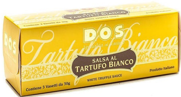
White Truffle Tris