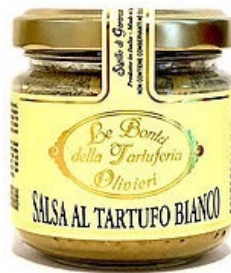
white truffle sauce 80g/130g