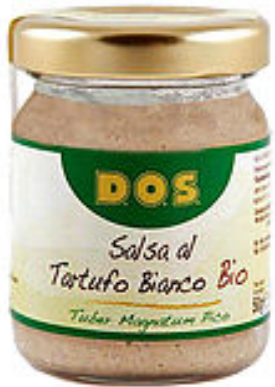
organic white truffle sauce 50g/80g

D.O.S. was one of the first Companies to introduce organic truffle specialties in the market. This line is aimed to those who are looking for natural and authentic and tasty truffle products.