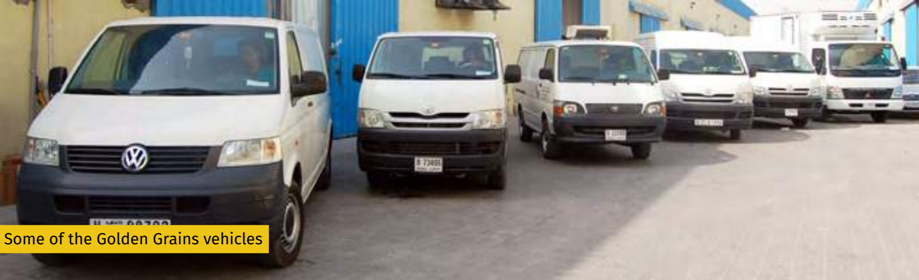
Some of the Golden Grains vehicles