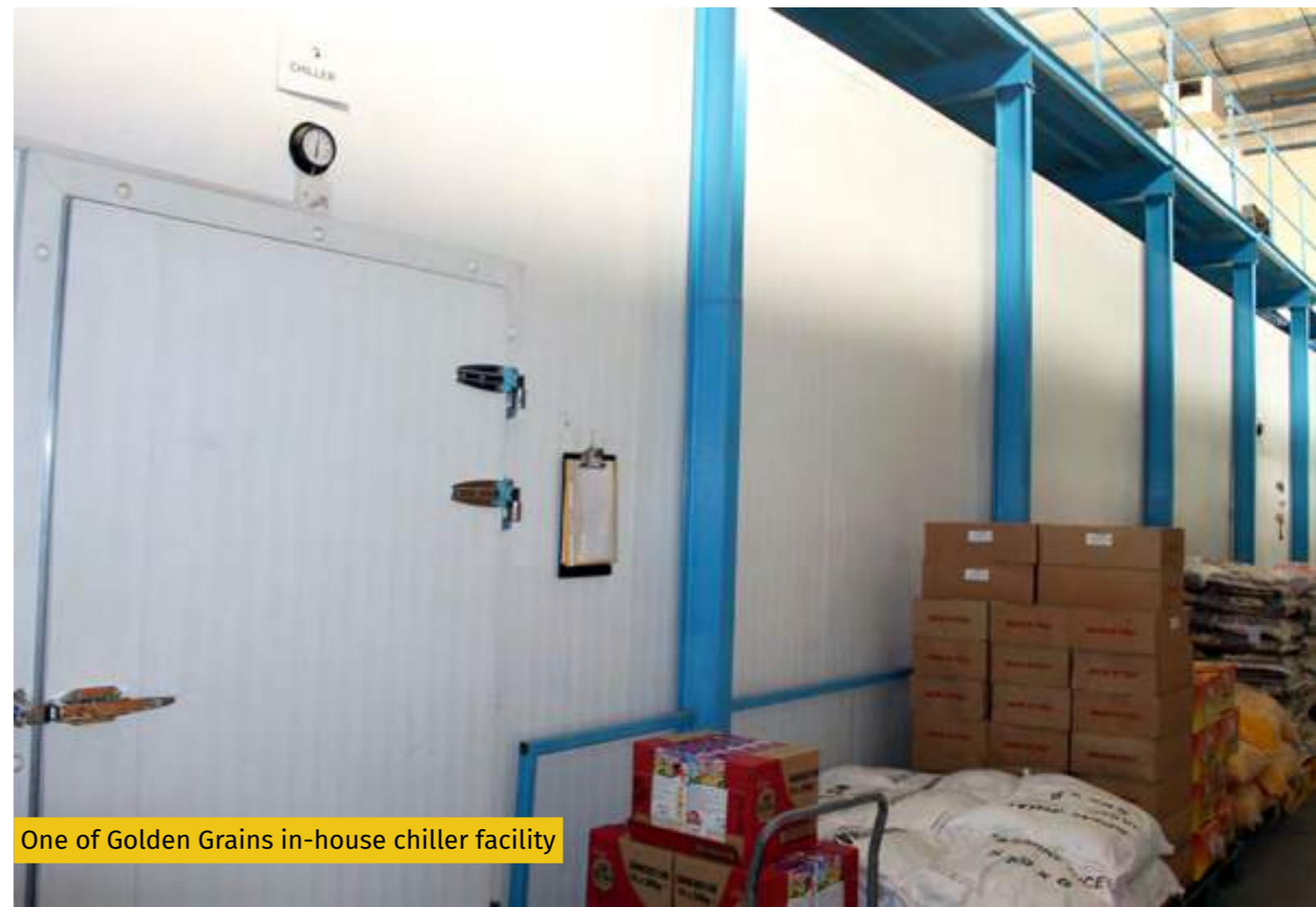
One of Golden Grains in-house chiller facility