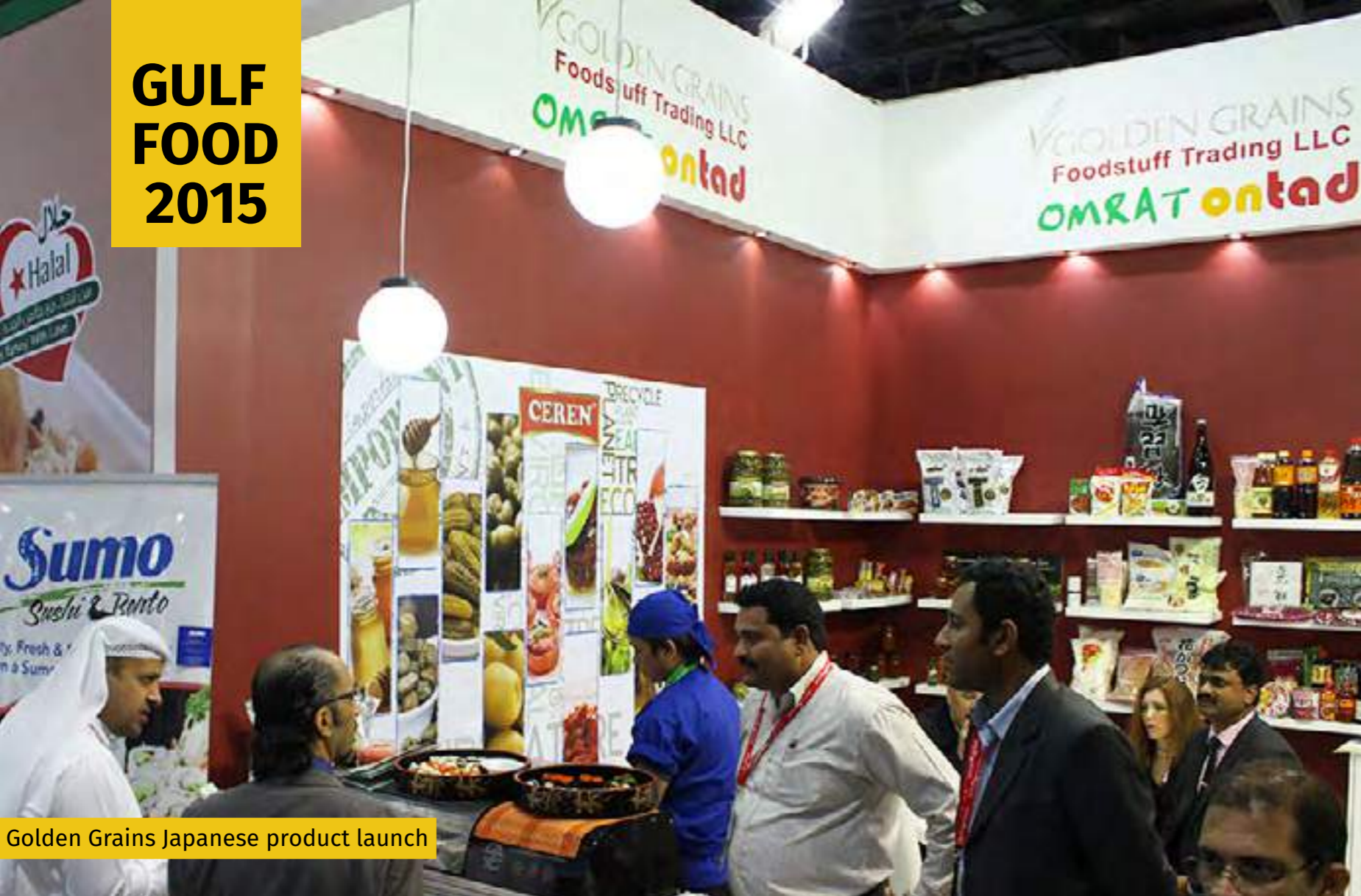
Golden Grains Japanese product launch