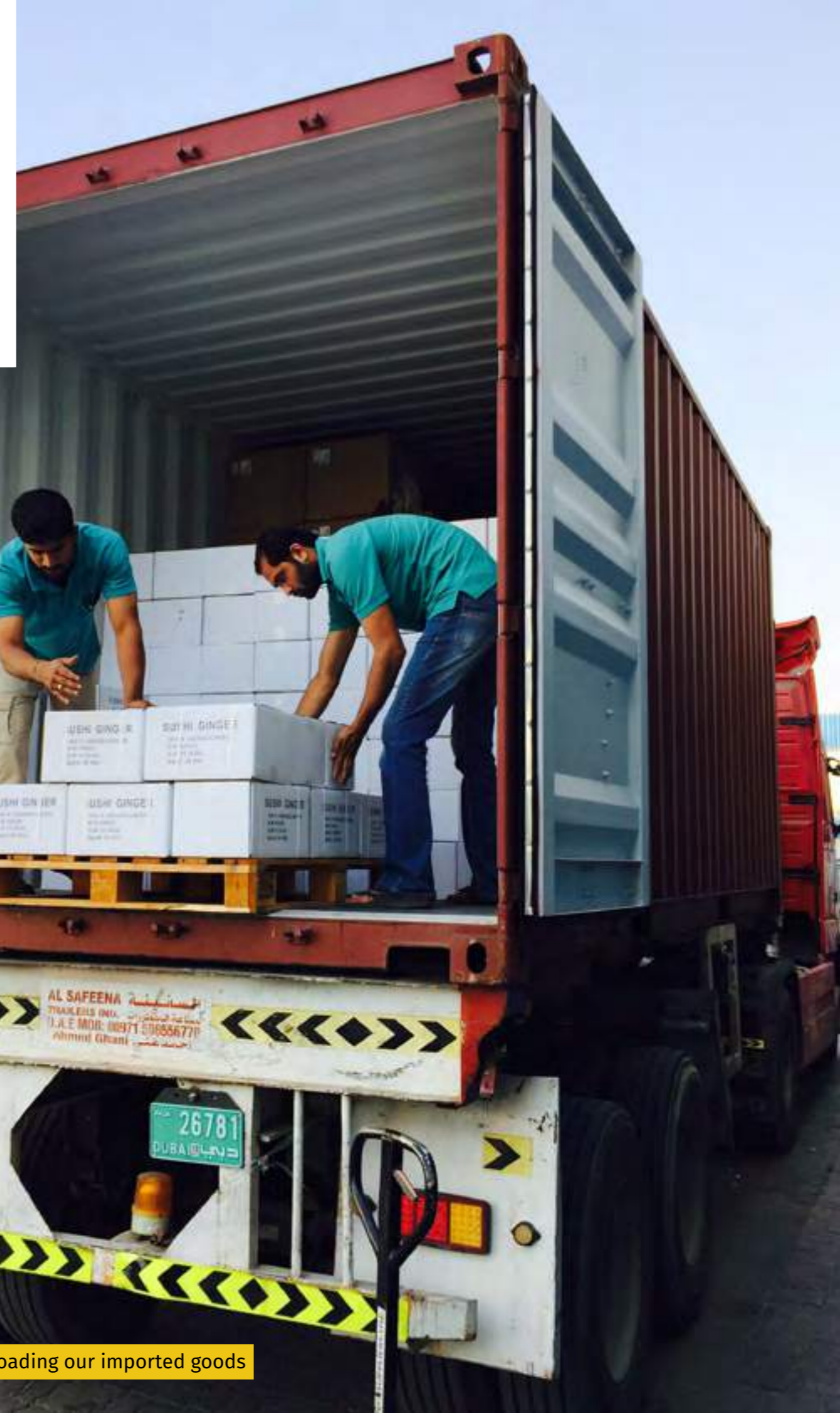
Golden Grains staff unloading our imported goods