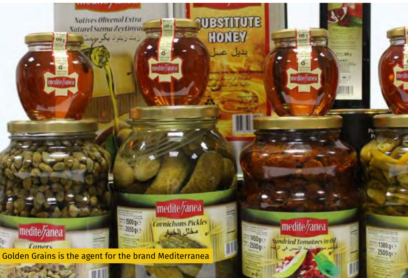
Golden Grains is the agent for the brand Mediterranea