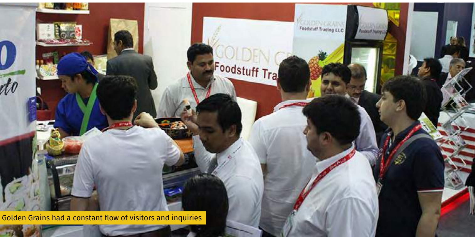
Golden Grains had a constant flow of visitors and inquiries