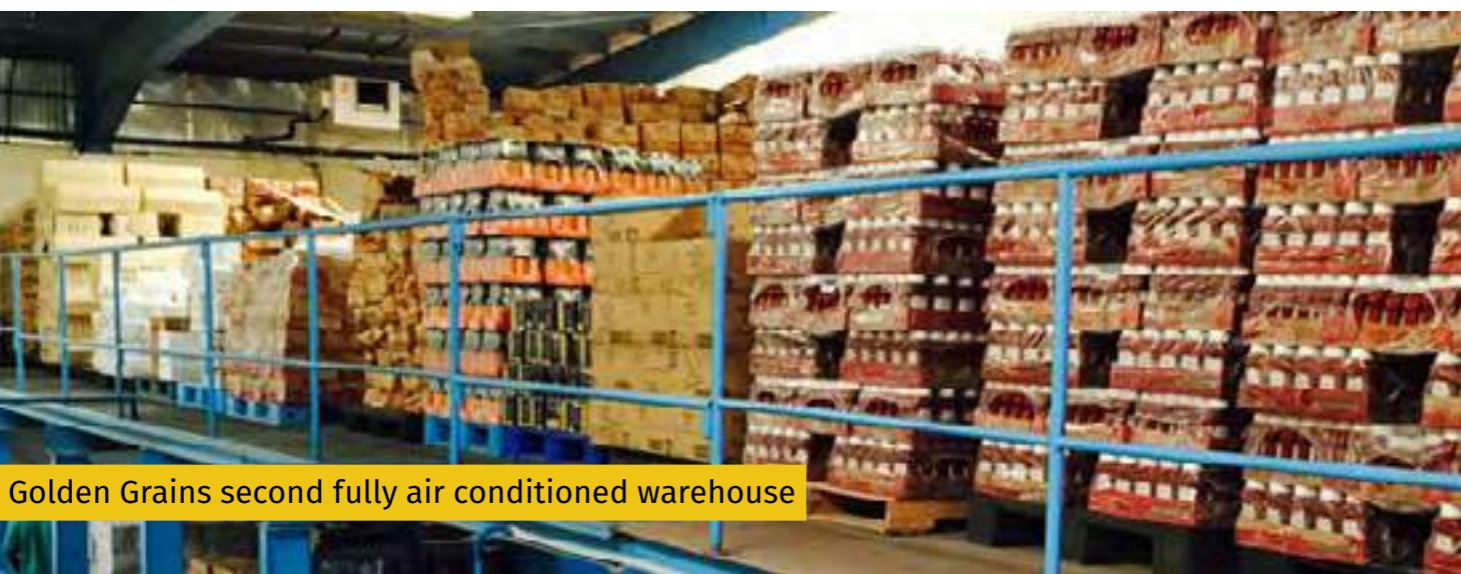
Golden Grains second fully air conditioned warehouse