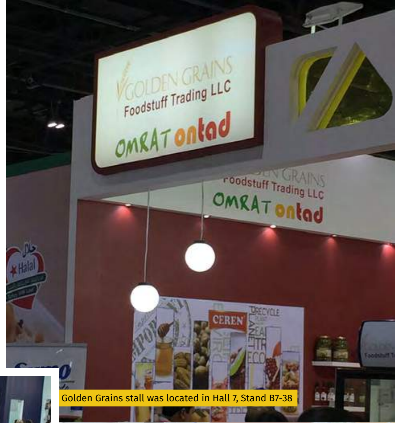
Golden Grains stall was located in Hall 7, Stand B7-38