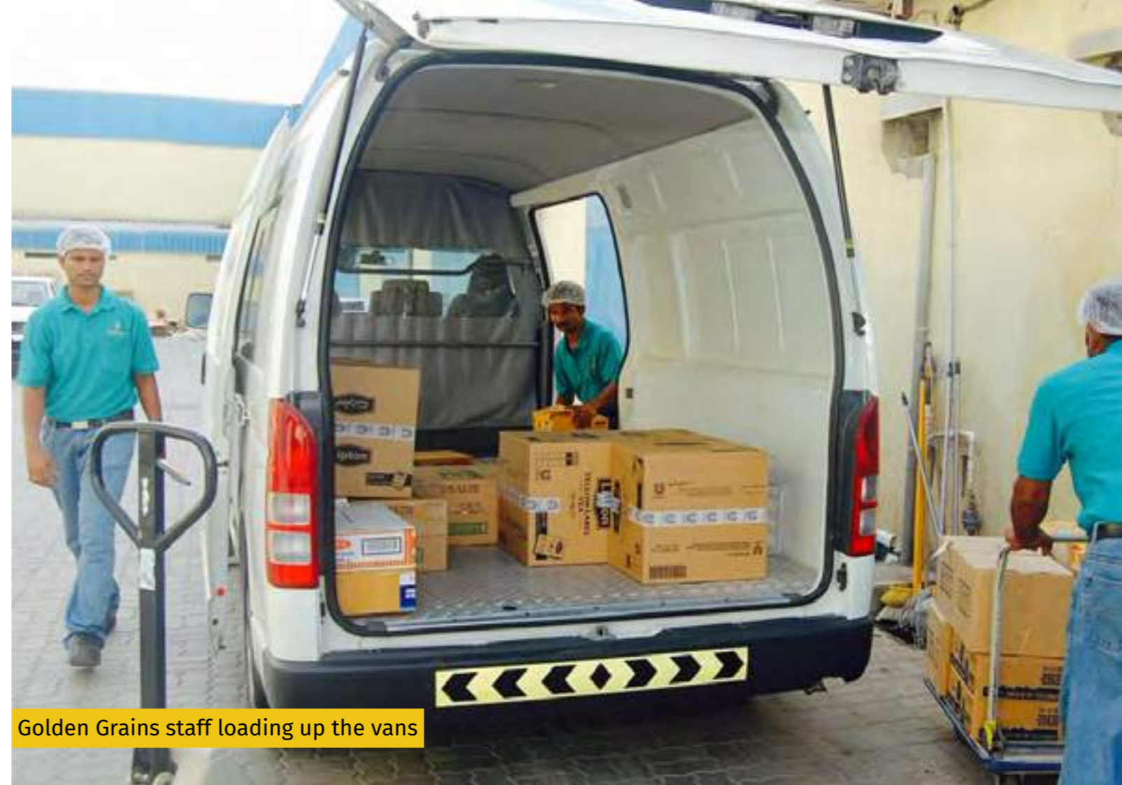
Golden Grains staff loading up the vans

22/23, Goodwill Premises, Swastik Estate, 17B CST Road, Kalina, Santacruz (E), Mumbai - 400 098, Maharashtra, India. Tel: 022-42200900