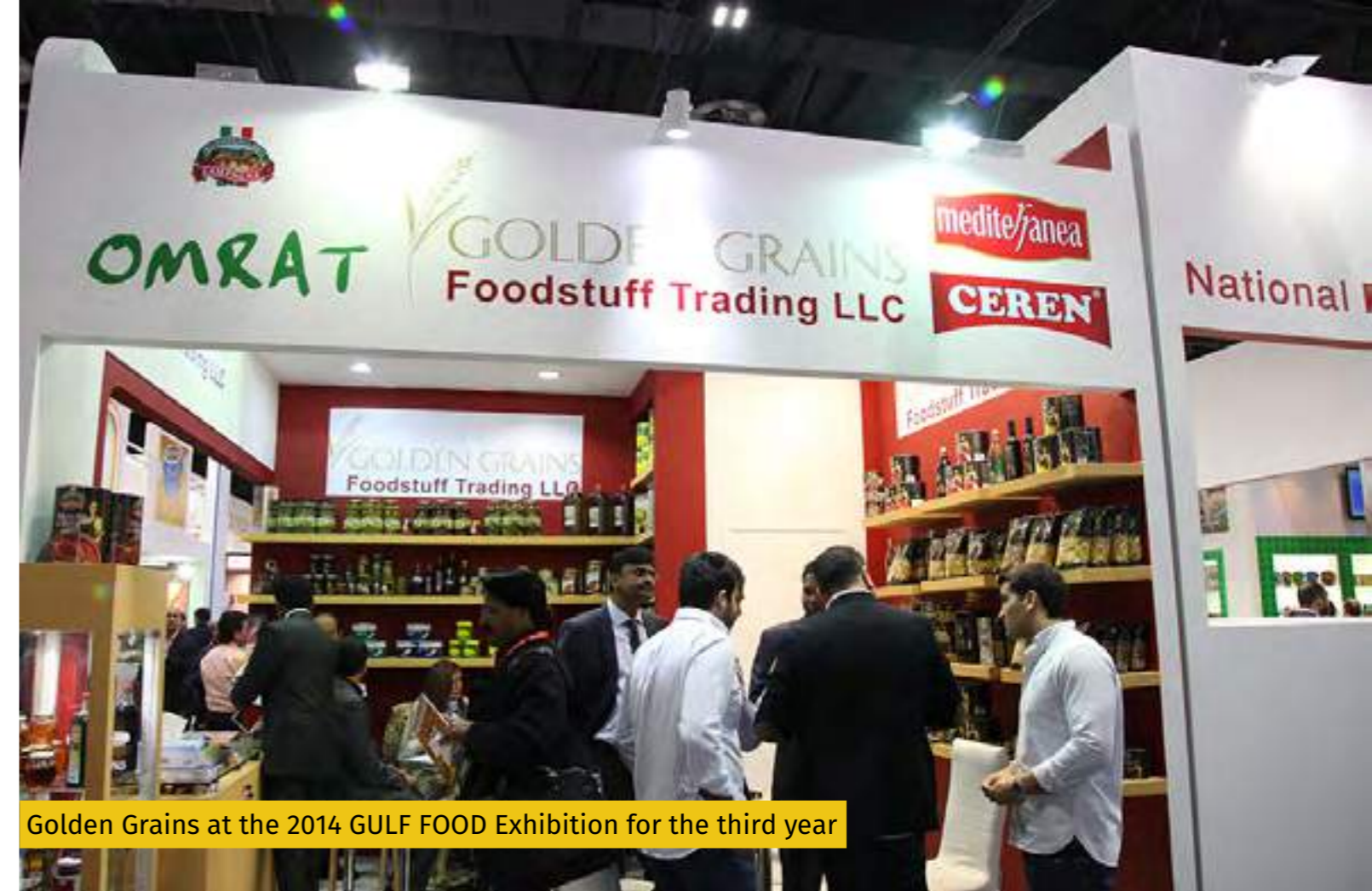
Golden Grains at the 2014 GULF FOOD Exhibition for the third year