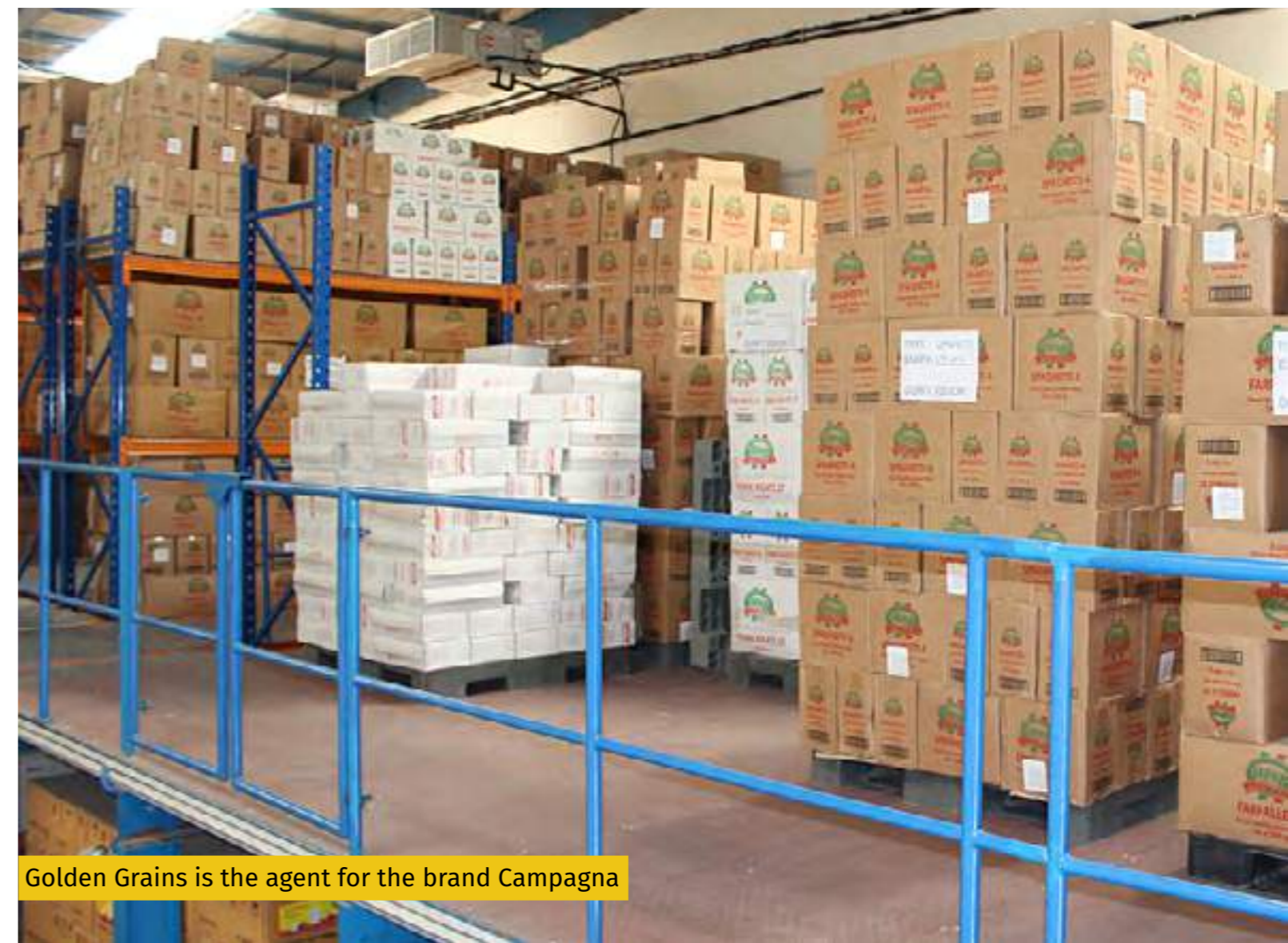
Golden Grains is the agent for the brand Campagna