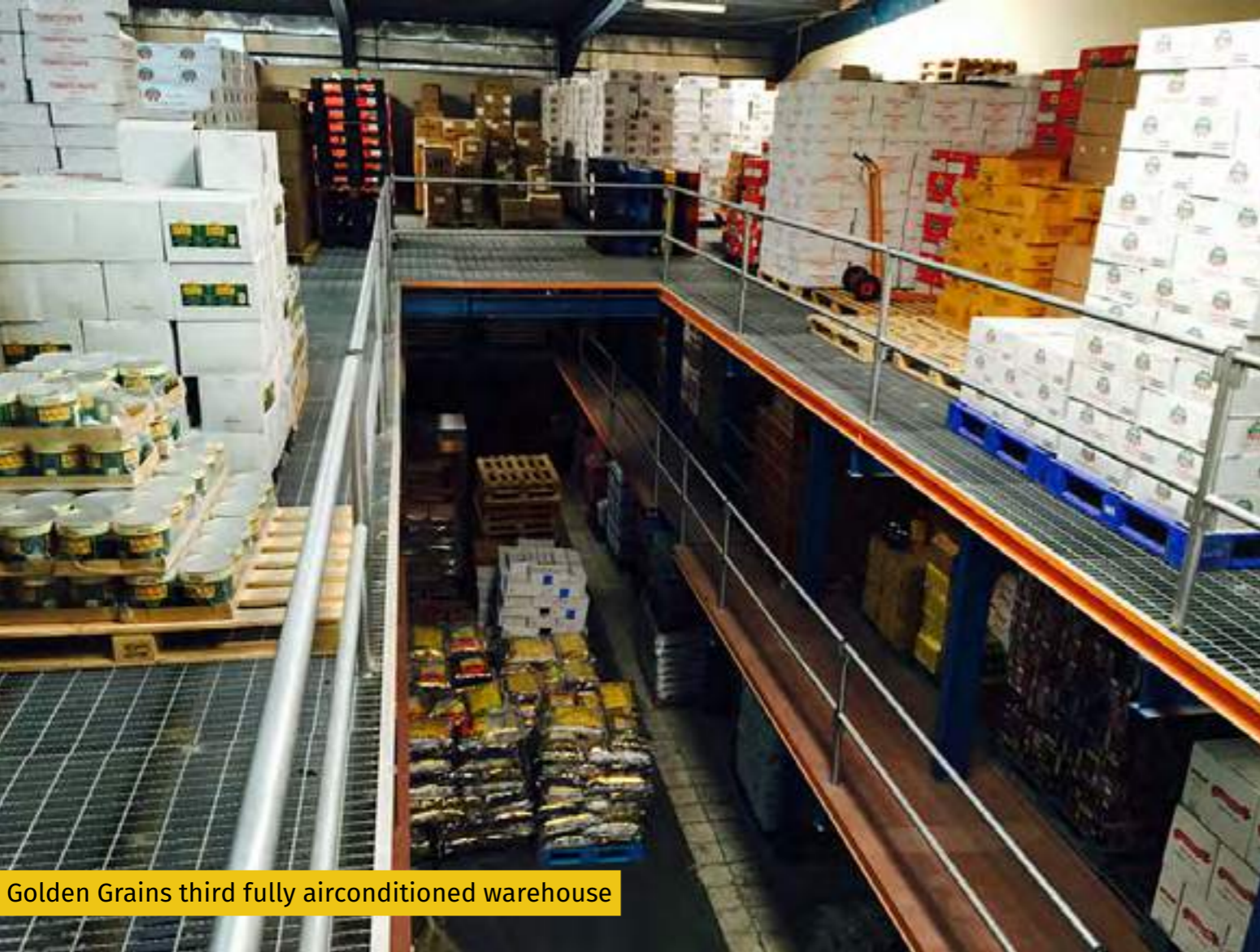
Golden Grains third fully airconditioned warehouse