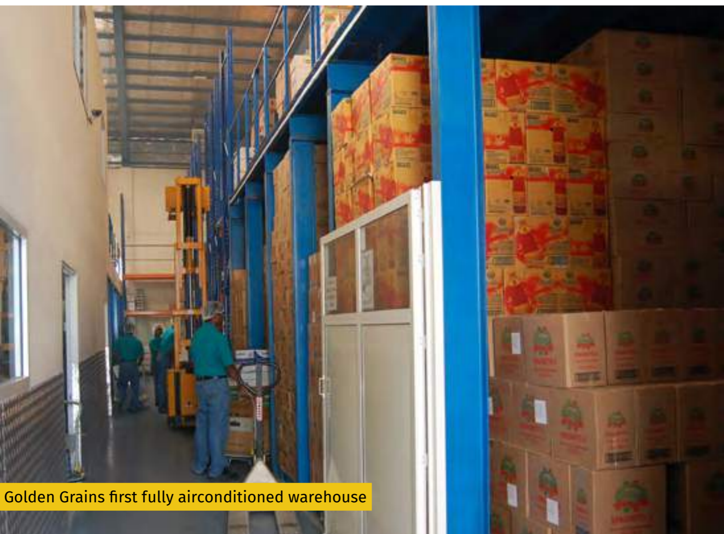
Golden Grains first fully airconditioned warehouse