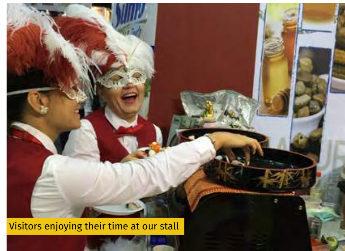
Visitors enjoying their time at our stall