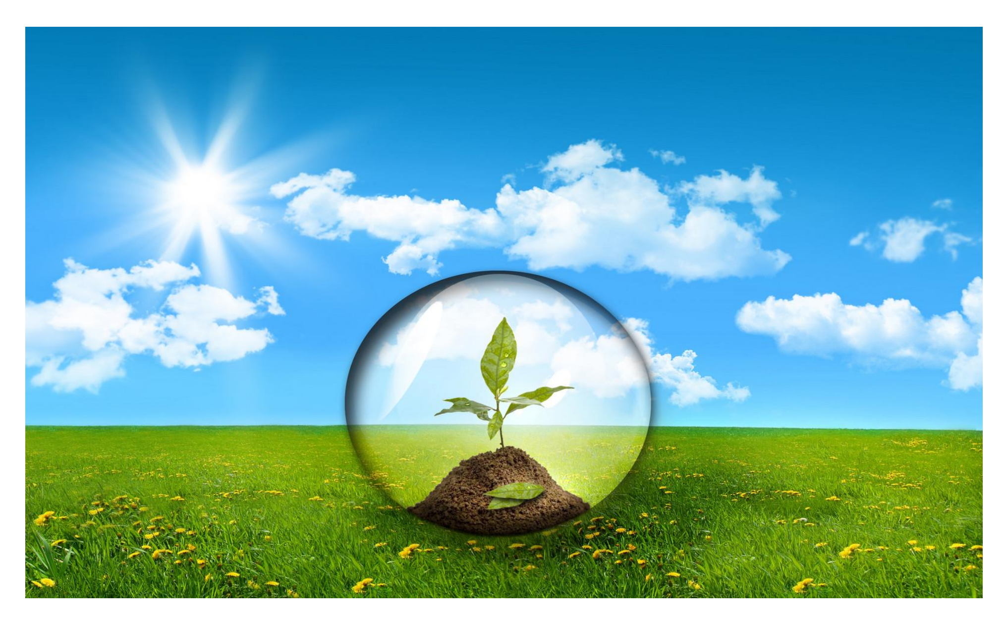
Uzbekistan's sunny nature and unique climatic conditions ensure the high quality of our products!